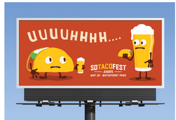
OUTFRONT Studios designed this OOH campaign for the San Diego Taco Fest, which is in the running for a 2018 OBIE Award.

Customers at Adams Outdoor Advertising can buy OOH formats and send ads to targeted consumers' mobile devices based on their location and/or online behavior. For Adams, this innovation attracts new revenue; for advertisers it expands exposure.